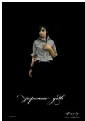
158 x 228 mm 240 pages