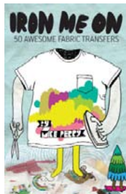
139 x 215 mm 30 sheets