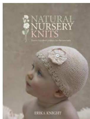
250 x 190 mm 144 pages