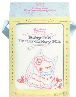
152 x 228 mm 24 pages