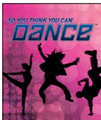
255 x 215 mm 224 pages